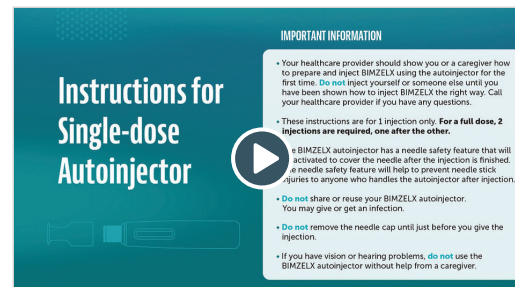
Injection Training Video